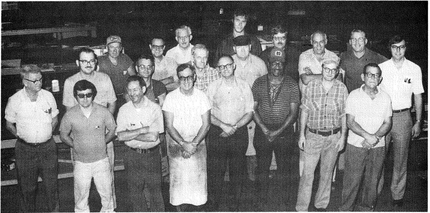
Taking first place in the July Safety Contest is Team 15. This team is made up of employees from Area 1563 (Plate Fabrication-Steel Shop). Congratulations, guys!